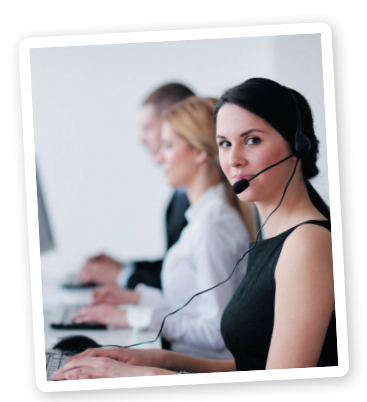
Your Client Service Team will be named contacts with a sound understanding of your objectives.